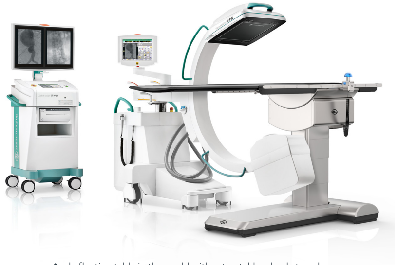
*only floating table in the world with retractable wheels to enhance image quality and optimize radiation exposure.

Taken together, the True Free Float™ technology, outstanding table top radiolucency and retractable wheels, is what makes the STILLE imagiQ2™ a true Low-Dose Enabler™ and the ideal C-arm complement for the mobile Hybrid OR or office suite.